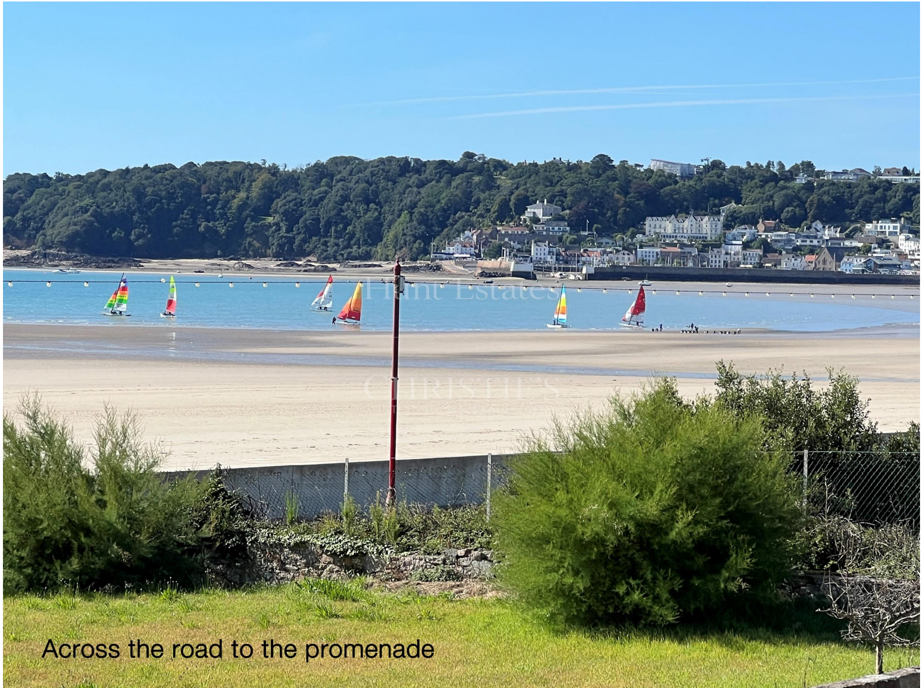
Across the road to the promenade